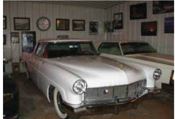
Mark II - one of Doc's 10 classic cars housed in his collector car garage