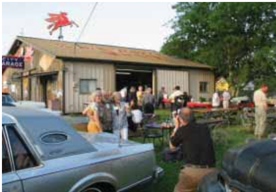
Friday Barbeque at Doc Ellis garage with great food and southern hospitality