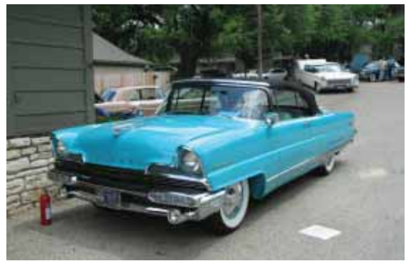
'56 Premiere Best of Show winner has been frame-off restored 3 times