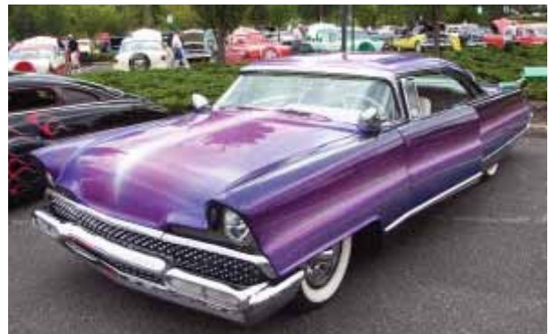
Latest Lincoln Retro Concept Car