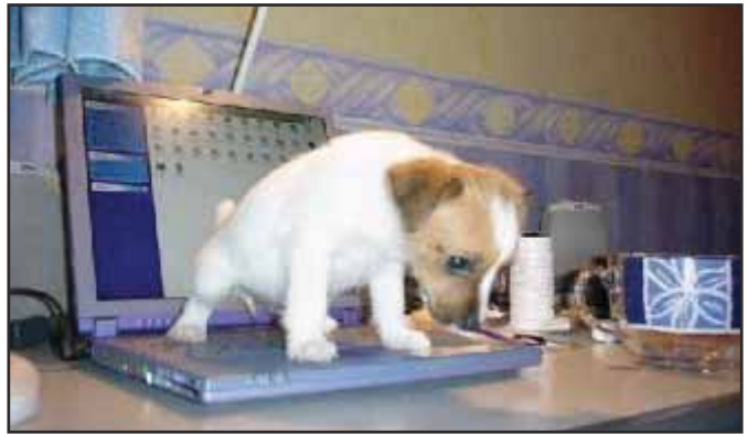
Sometimes I think this puppy has the right idea!