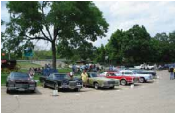
Concours Judging in front of Hotel Over 50 cars showed up for judging