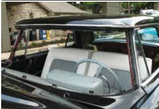
Mark II restoration in progress at the show No glass, door panels or working gauges yet.