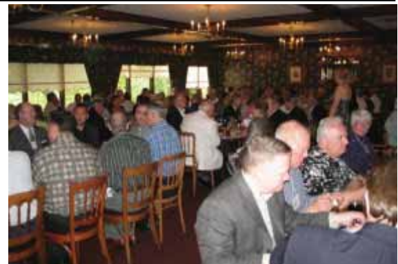
Saturday Night Awards Banquet Meal served at the Stage Coach Dining Room