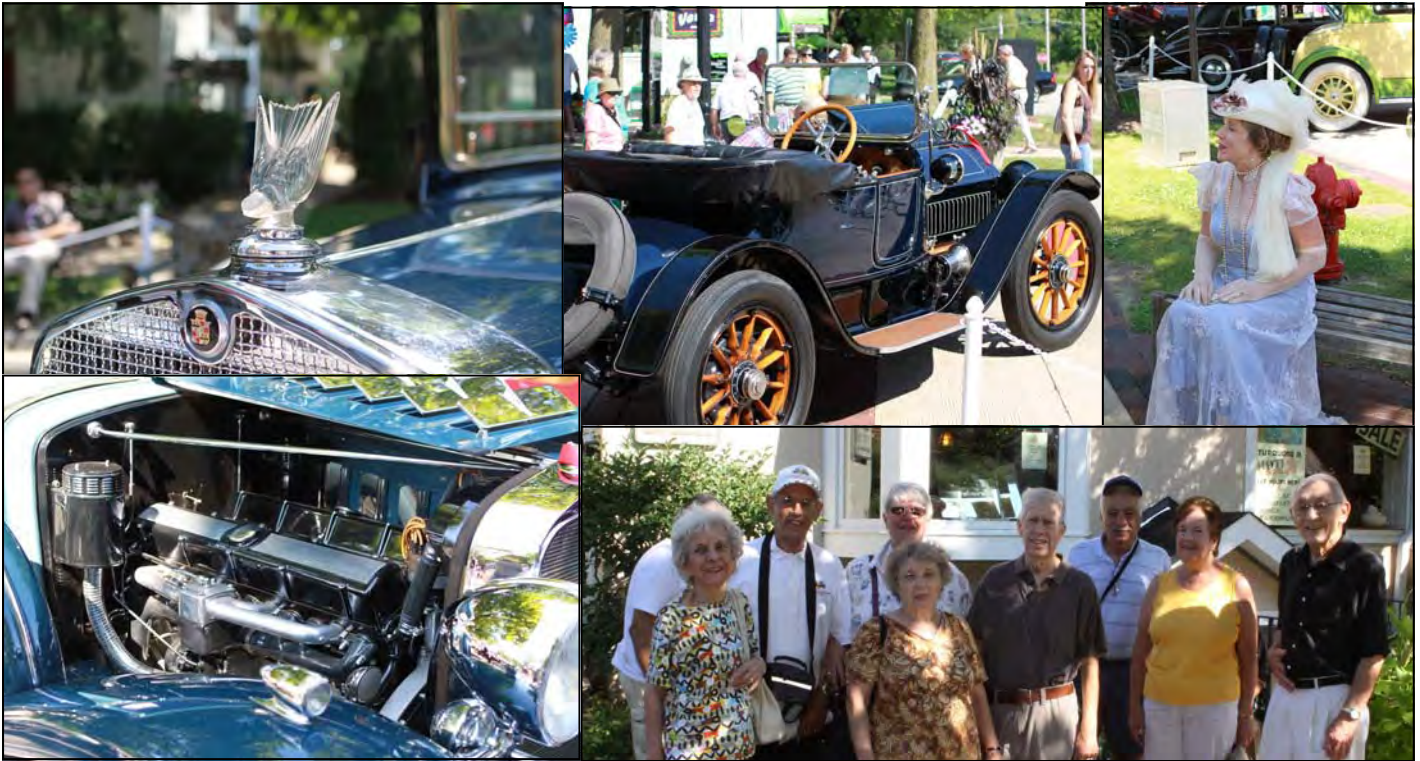
Photos from the 2010 Concours