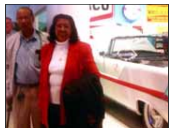
The Berry's checking out the '57 Lincoln