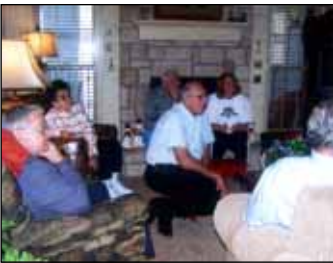
Annual Meetin held in Branson