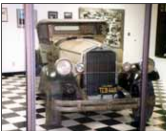
1930 Pace Arrow before restoration at McPherson College