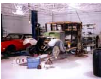
Restoration shop at McPherson College