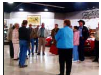
Listening to narration on Morrison Collection