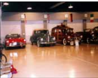
Morrison Collection at Salina, Kansas