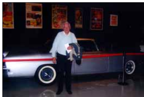
We had one just like this '57 Mark II