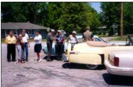
Members visiting before lunch