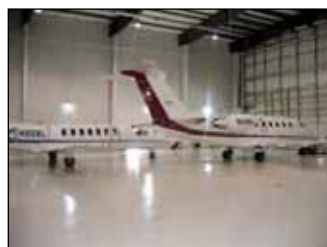
Dick Levi's Corporate Jets