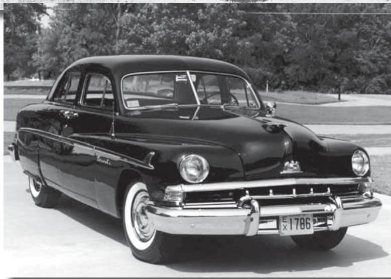
From the front, the Lincoln Cosmopolitan (above) and the standard Lincoln, sometimes called the "baby Lincoln" (at left) appeared identical. However, the Lincoln Cosmopolitan had a unique body while the "baby Lincoln" shared a body shell with Mercury models. The sport sedan models of each Lincoln series are shown here.