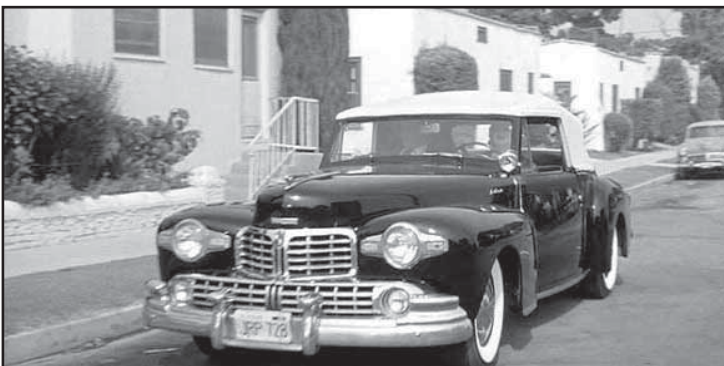
Joan Crawford & Bette Davis What Ever Happened to Baby Jane

PS – If you haven't see all these movies, or if it's been a long time, make sure your next order from Netflix or your next trip to the video store includes a DVD of at least one of these. What a blast from the past!!!