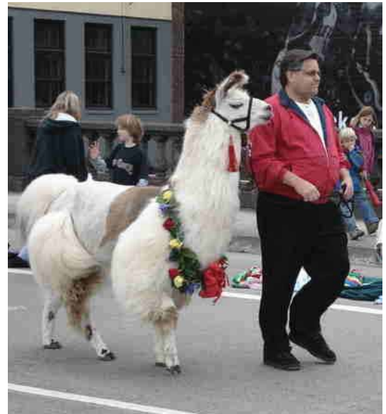
Llama's will be marching in the Shafer Founders Day parade this coming May.