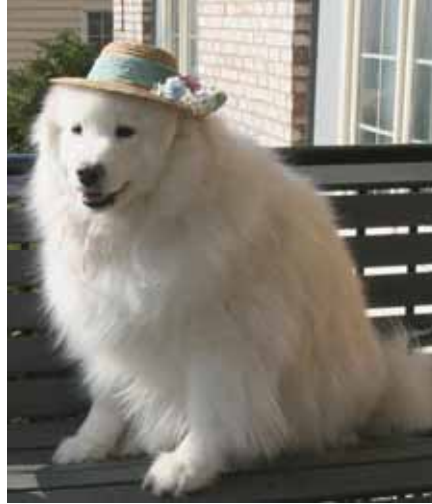
Ch. Faithie is looking forward to Easter, and the big parade! In her Easter bonnet, with all the frills upon it, she'll be the grandest lady in the Easter parade.