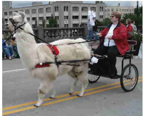
Look for Llama powered carts going back and forth between the Shafer airport and the downtown business district.