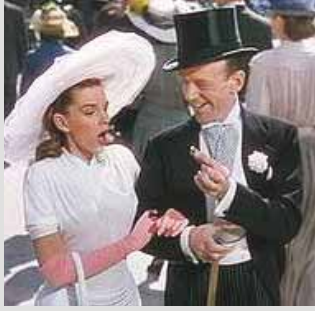
Easter Parade Staring Fred Astaire and Judy Garland.

In your Easter bonnet, with all the frills upon it, you'll be the grandest lady in the Easter parade.