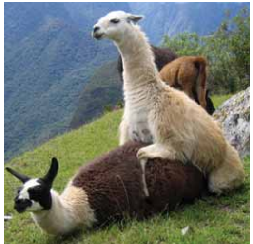
These sweet creatures provide constant amusement for adults, and a never ending stream of questions from young children.