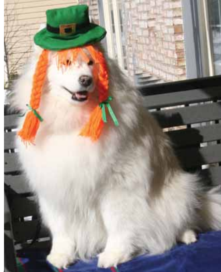
Ch. Faithie, the good Irish girl that she is, shown getting ready to celebrate St. Patrick's day and her birthday. Join her in a toast on these two great days. May the luck of the Irish be with you.

February is almost a memory. With our good friend the sun getting higher in the sky every day, the period between sunrise and sundown is also lengthening and as an added benefit, daily temperatures are rising. The light at the end of the tunnel is the sun and at the far end, will be spring. It's time to start thinking about awakening our fine old automobiles from their slumber and once again getting them ready for the road. We will also be glad to welcome back our club members, those who made the ultimate sacrifice and spent the winters in much warmer climates. I won't name any names, you all know who you are.