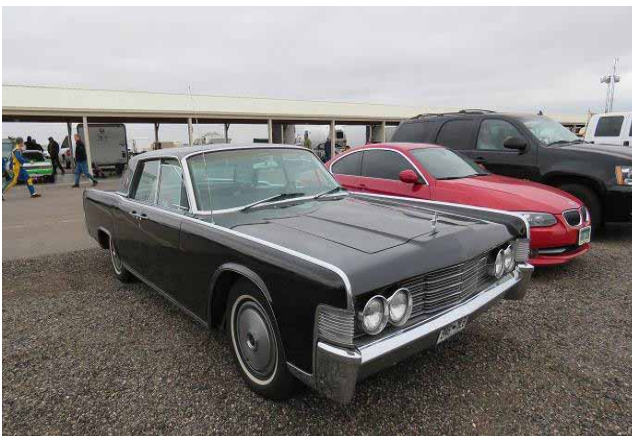
Christy's '65 Continental Sedan