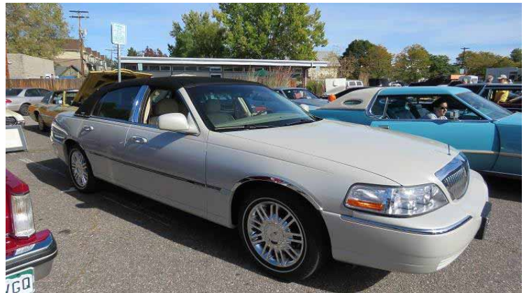
The Perrott's Town Car