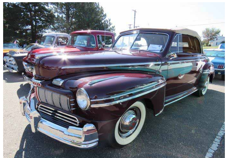
No More of These