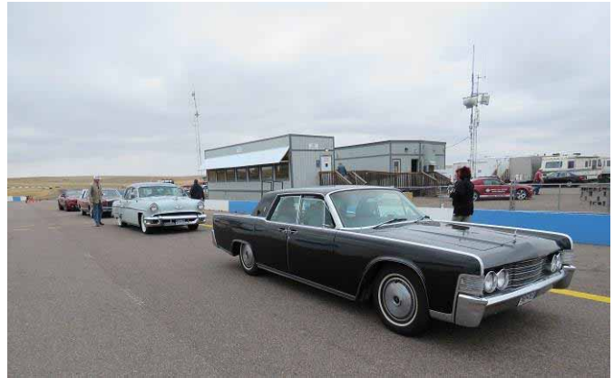
Ready to Provide Rides