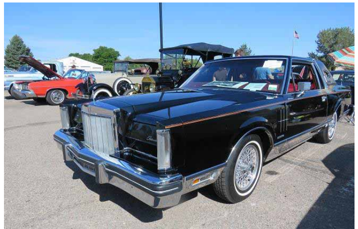
Craig's New Mk VI